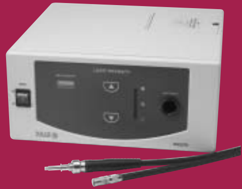
Our Xenon Series is offered in both the 175w and 300w configurations. Fits any fiber optic cable utilizing versatile sleeve adapters. Easy bulb access.